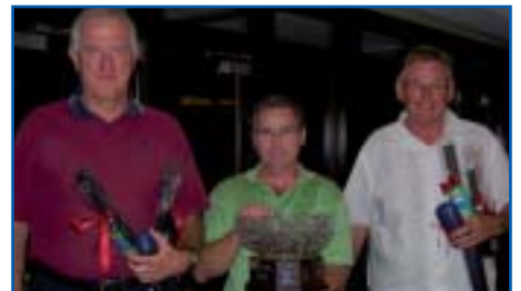
Winning Team Members